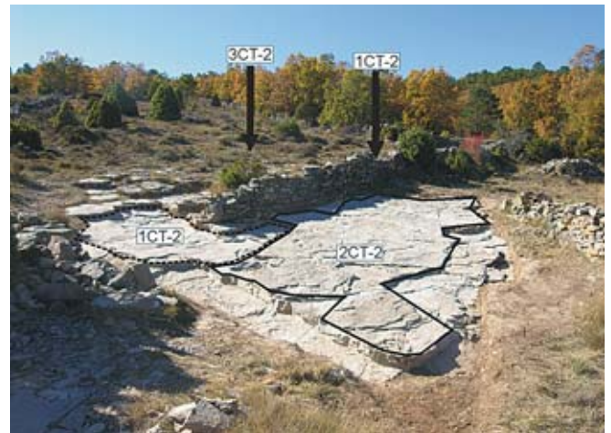
Figure 2. General view of the El Pozo CT-2 site with its three different levels (modified from Alcalá et al. , 2014). Notice the placement of 3CT-2, covered to favour its preservation.

smaller than those of the quadrupedal trackway attributed to the small ornithopod described from Las Cerradicas, Galve, Teruel, by Pérez-Lorente et al. (1997).