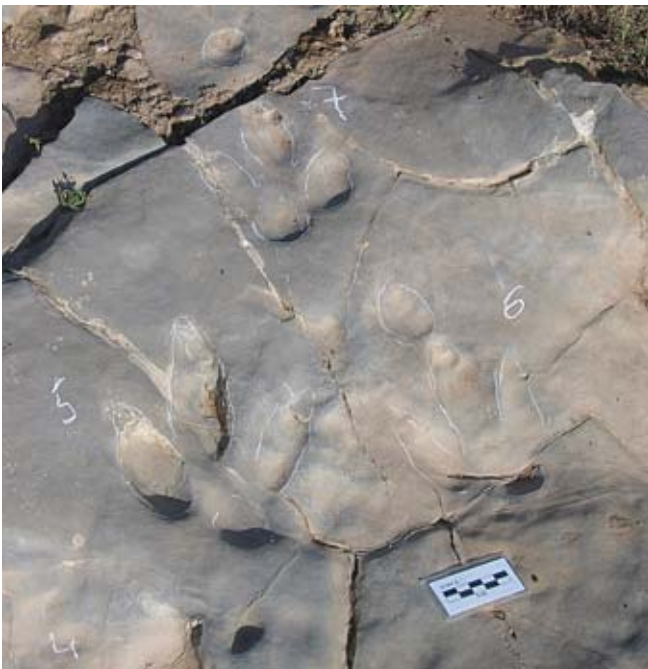
Figure 4. Ornithopod tracks details: 3CT-2-8p (marked as 5); 3CT-3-3p and 3CT-3-3m (marked as 6); and 3CT-2-4p and 3CT-2-4m (marked as 7).

Finally, there are some isolated tridactyl tracks (3CT-2-6p; 3CT-2-7p; 3CT-2-8p, 3CT-2-11p, 3CT-2-14p, 3CT-2-18p) with different degrees of preservation. 3CT-2-8p (Figs 3, 4) is a well preserved tridactyl pes with L/W=1.3 where digit III is a bit longer (16 cm) than digits II (12 cm) and IV (11 cm). The absence of manus tracks association and the occasional overlapping of morphologies between theropod and ornithopod tracks leaves the attribution to a definite trackmaker uncertain, although the similar characteristics of these tridactyl tracks to the quadrupedal trackway ones point to the fact that they belong to the same ornithopod trackmaker.